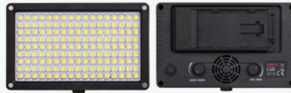
S-2241 153 SMD-LEDs

12W power, 300Lux @ 1 meter center 120°(half-declined 68°) wide beam angle 3200K-5600K continuously adjustable 10%-100% flick-free dimming Super high CRI Ra≥93, TLCI≥97 143(W)×91(H)×34(D)mm, 166g