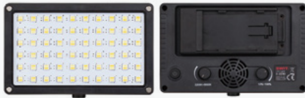
S-2240 60 SMD-LEDs