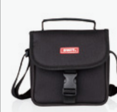
Portable Bag x1